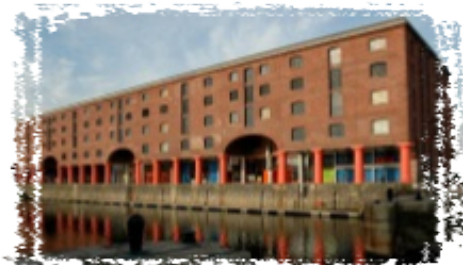
Monday 1st July Albert Dock