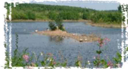
Monday May 13th Wirral RSPB Nature Reserve