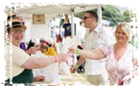
Friday 7th June Southport Food Festival