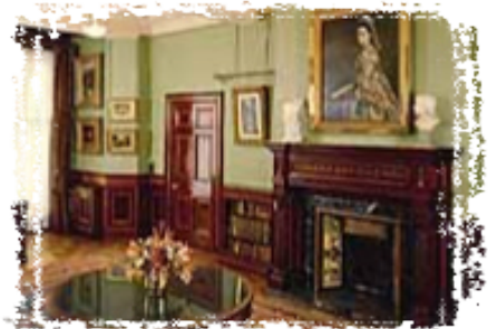
Wednesday 24th April Sudley Hall