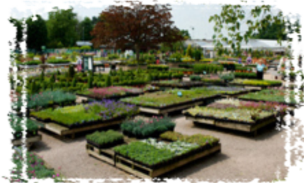
Wednesday 10th April Bridgemere Nursery

There's still spaces on the trips for 2013 so put your name down early to reserve a space. Call Judy on 0151 489 1412